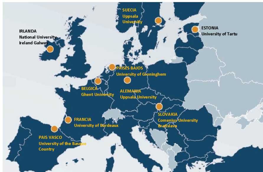
Map of the ENLIGHT alliance of nine EU universities.

In order to achieve these objectives, it is necessary to build new pathways to generate opportunities for learning, research and transfer. These opportunities will generate results in the medium and long term thanks to various lines of action, for example: